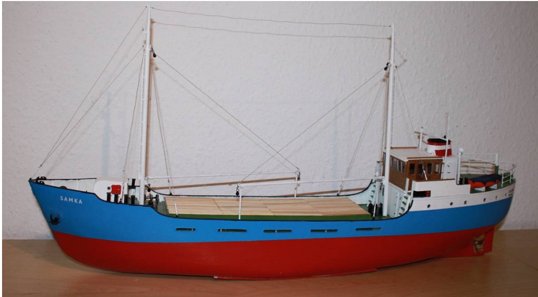
MS SAMKA (1956)