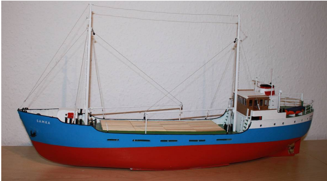
MS SAMKA (1956)